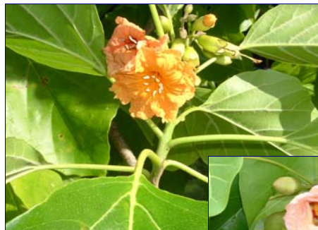
Kou - Cordia subcordata

The other benefit to promoting these species is to provide habitat for native birds and fish. Because of invasive alien species like the mangroves, haole koa and noxious vines, native flora is not well equipped to compete with this stronger counterpart.