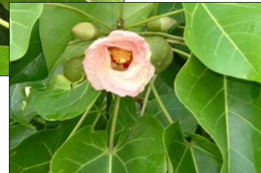
Milo - Thespesia populnea

Please help us celebrate Earth Day on April 22 nd by planting more native species at the park. Individuals and groups are encouraged to call today and sign up for a fun day of planting and celebrating Spring!